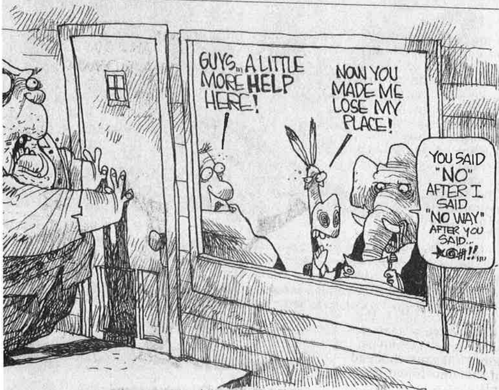
NIGHT OF THE LIVING DEBT